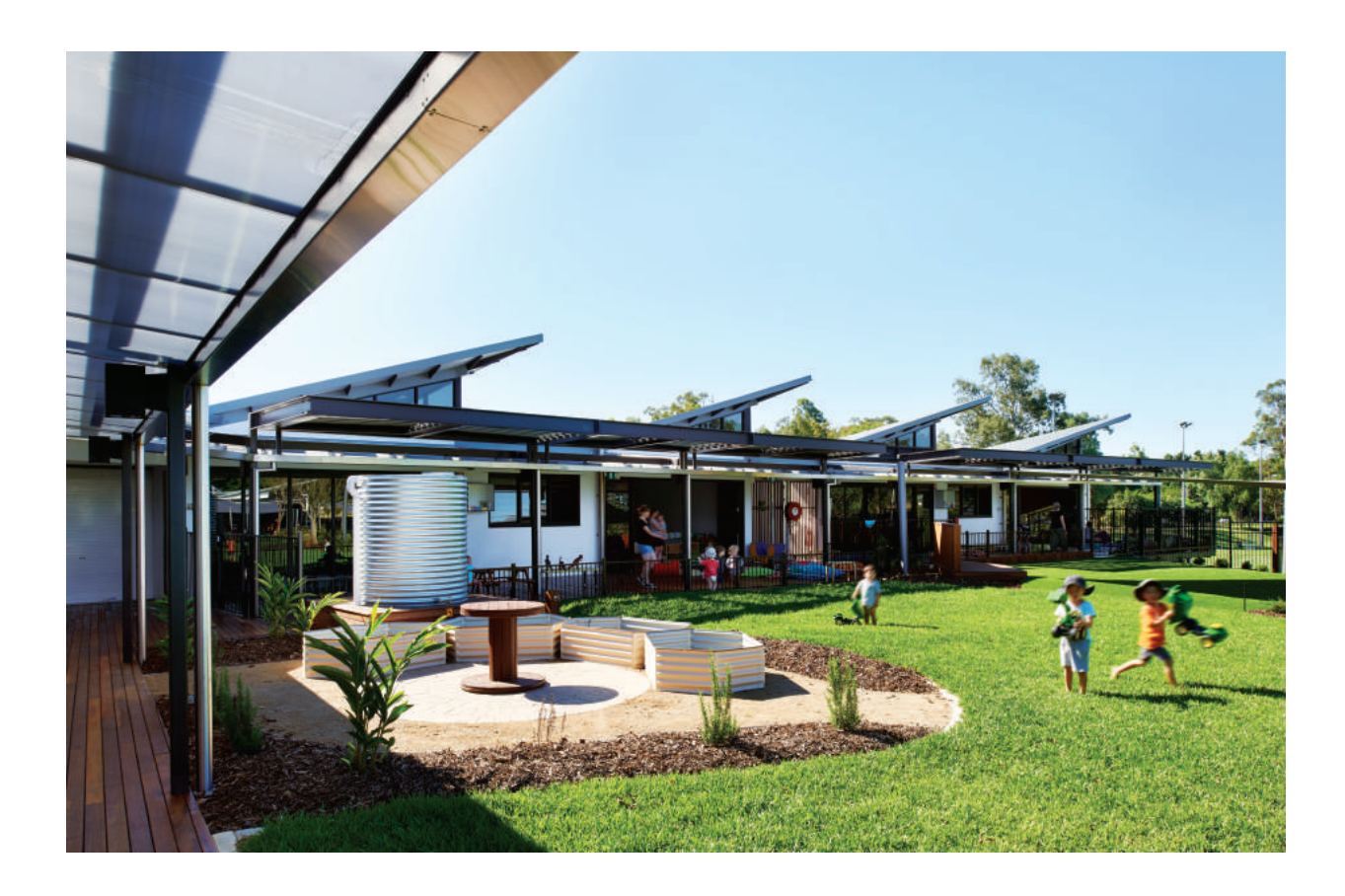
"Beyond that connection to the outdoors, it's also about highly tactile surfaces and the various textures of the material palette."

with judicious pops of lime green, pink and blue at ground and mezzanine levels. The children are seemingly enveloped by a rainbow, but because the teaching takes place at their scale, they're never distracted. Aesthetically, it allows the cavernous white space to playfully avoid a stark whitewashing.